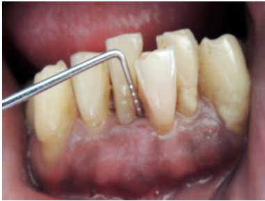
Figure 1: Preoperative view

The procedure is associated with a number of limitations like relying on patient's motivation and maintenance of oral hygiene, limited functional efficiency, irritation to the tongue and chances of splint breakage. Presence of mal-aligned or pathologically migrated teeth especially if more than one, sometimes poses a problem in placement of these pontics due to limited space to accommodate them. The major limitation anticipated in this treatment was of functional efficacy; hence, a more permanent solution must be offered to the patient.