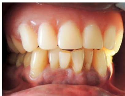
Figure 5: Postoperative view after splinting of natural pontic and in occlusion.