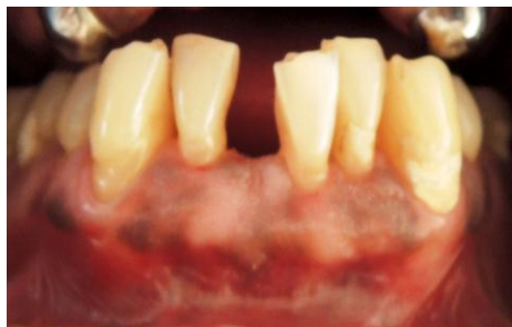
Figure 3: Post extraction view